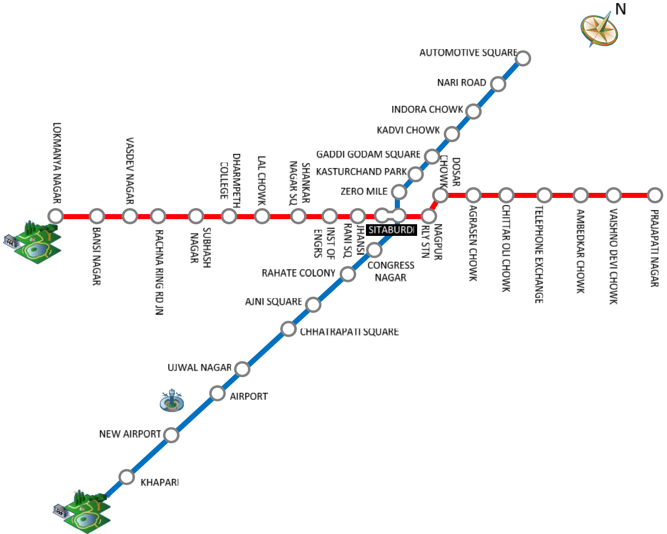
Figure 1: Proposed corridors (N-S & E-W) for Nagpur Metro